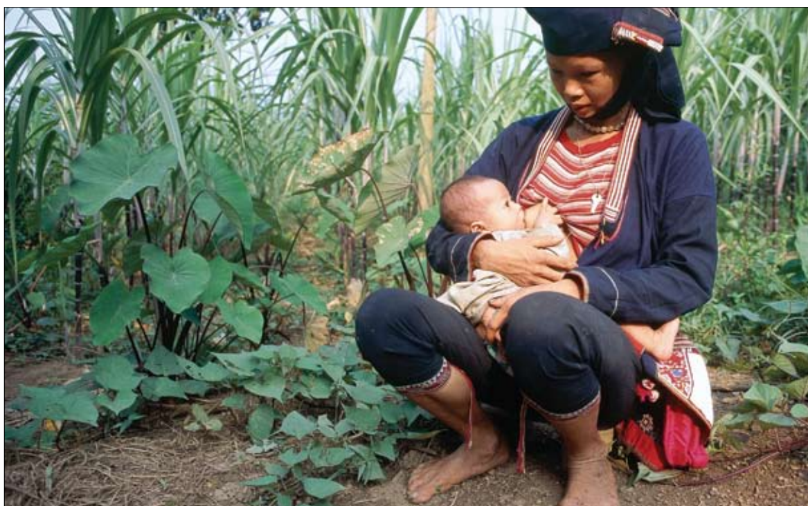
Vietnamese woman breastfeeding her child