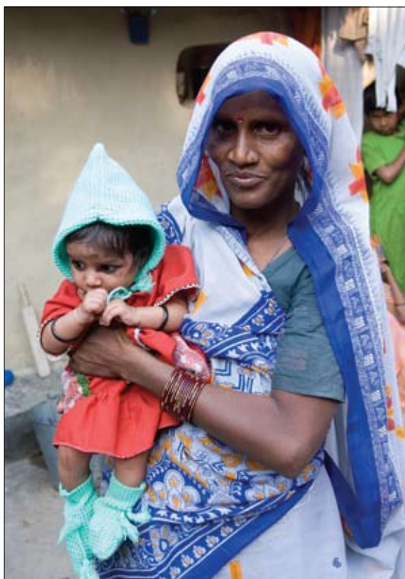
Indian woman holds child